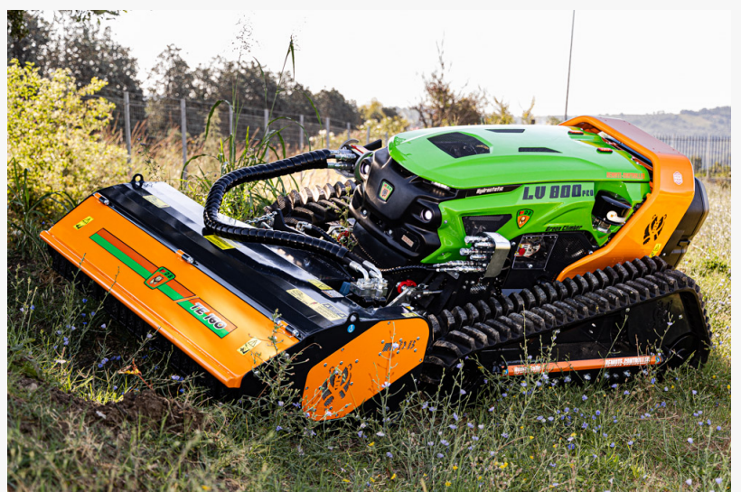
MDB TE 160 Grass, Weed and Light Brush Accessory Head

This wider design allows for faster and more efficient clearing of land, saving time and fuel. The TE 160 is compatible with the Green Climber LV 600 PRO and LV 800 PRO models.