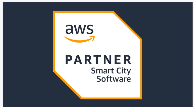
Opendatasoft achieves AWS Smart City Competency