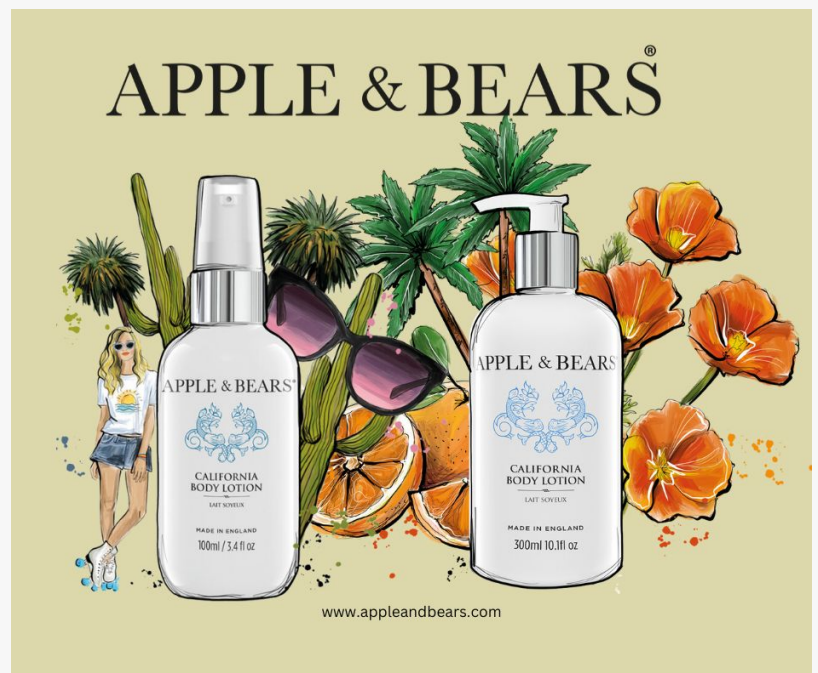
APPLE & BEARS California Travel Set