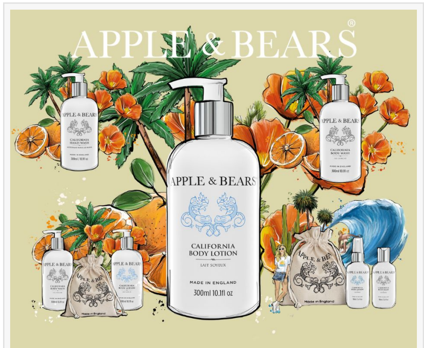
APPLE & BEARS California Range

APPLE & BEARS is a luxury skincare brand committed to creating exquisite products that blend the finest natural ingredients with a love for the environment. With a focus on sustainability, ethics, and superior formulations, APPLE & BEARS aims to provide an indulgent and eco-friendly skincare experience. Their range includes moisturizers, body washes, shampoos, and more, all made with love and care for both your skin and the planet. For more information, visit