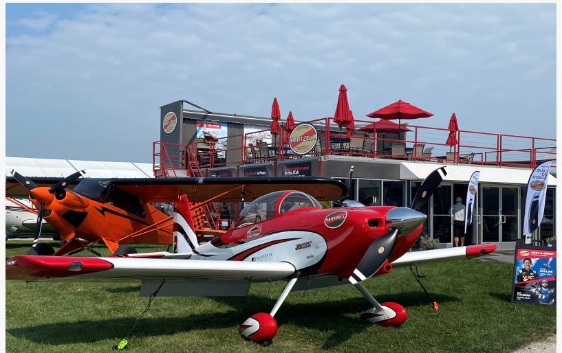
Hartzell's Booth 296-297 at EAA AirVenture Oshkosh.

OSHKOSH, WIS., USA, July 17, 2023 /EINPresswire.com/ -- Hartzell Propeller's dynamic presence at EAA AirVenture Oshkosh 2023 features plenty of airplanes, propellers, airshow pilots, special deals for backcountry flyers, pilot proficiency sessions, and even Warbird tram tours. AirVenture Oshkosh 2023 begins Monday, July 24 and runs through Sunday, July 30.