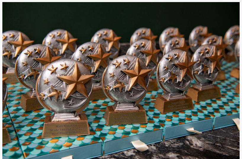
Trophies for BPTW

Thread's remarkable growth and success are a testament to its commitment to delivering exceptional human capital management solutions while fostering an environment where employees can truly Deliver Wow. The company's dedication to its core values has attracted top talent and established Thread as a trusted partner in driving organizational success.