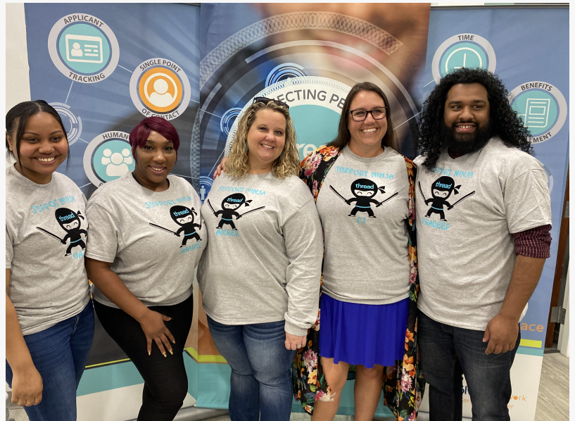
Thread's Support Team