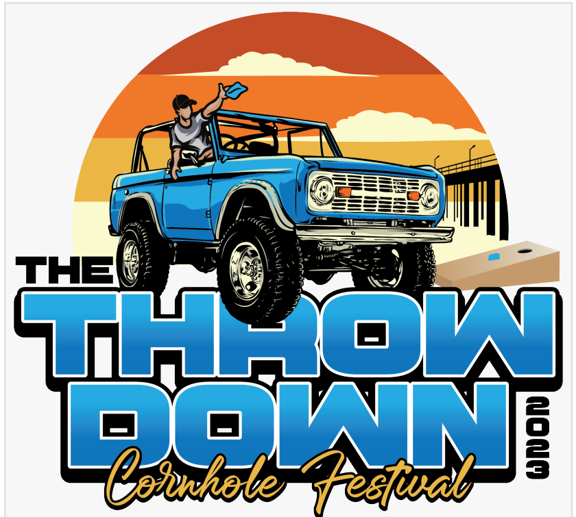
The Throwdown Cornhole Festival & Car Show Logo

Well-known car clubs from throughout California are participating including K5 Nation SoCal and Pacific Coast Broncos & Fords. Prizes will be awarded in many categories including "People's Choice," "Farthest Attended," and