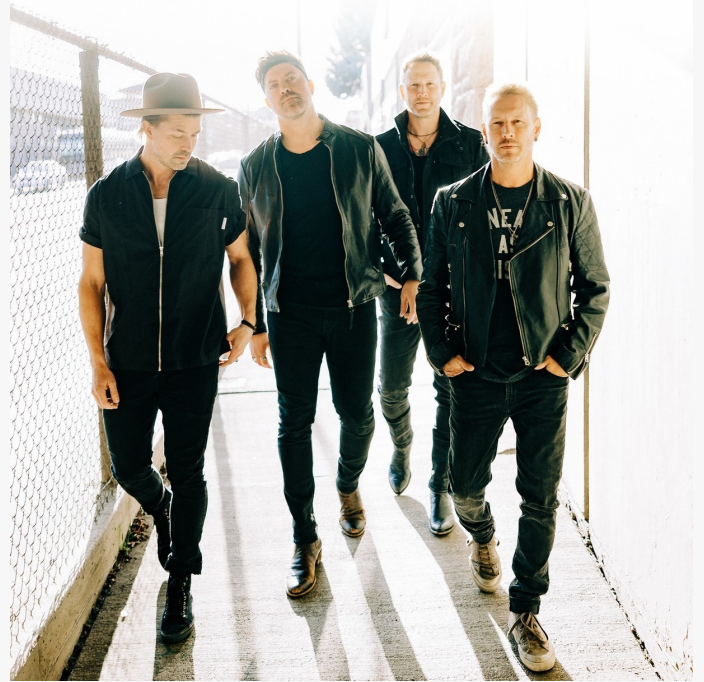
Century Drive Band