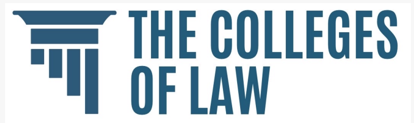
The Colleges of Law

This press release can be viewed online at: https://www.einpresswire.com/article/644870431