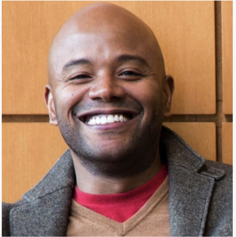
Dr. Peniel E. Joseph