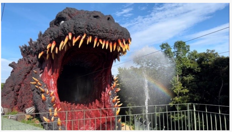
Get splashed in front of the giant Godzilla!