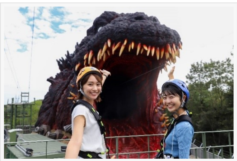
Make unforgettable summer memories with friends! | TM & © TOHO CO., LTD.

I"Jet Jaguar/Megalon Special Exihibition" Begins July 1 at World's Only Permanent Godzilla Museum! Marking the 50th anniversary of the release of "Godzilla vs. Megalon", a special exhibition will be held at the Godzilla Museum at Nijigen no Mori's super-popular attraction "Godzilla Interception Operation". The exhibition will run for a limited period from Saturday, July 1, 2023 to Monday, January 8, 2024. The original exhibition will celebrate of the retro yet comical Showa-era movies and feature dioramas that recreate some famous scenes. We'll also be holding a popularity contest between arch-rivals