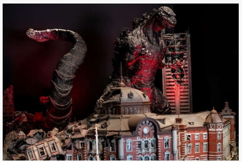
Enjoy dioramas from decades of movies at the Godzilla Museum | TM & © TOHO CO., LTD.

attraction lets you feel the true awesome power of the world-famous monster. Participants will join the National Awaji-Island Institute of Godzilla Disaster (NIGOD) and take part in highly detailed research missions that will see them infiltrate Godzilla's body via zipline and eliminate dispersing Godzilla cells in a shooting game. Visitors can also purchase original NIGOD goods and enjoy dishes specially designed with the theme of "Godzilla Interception Operation".