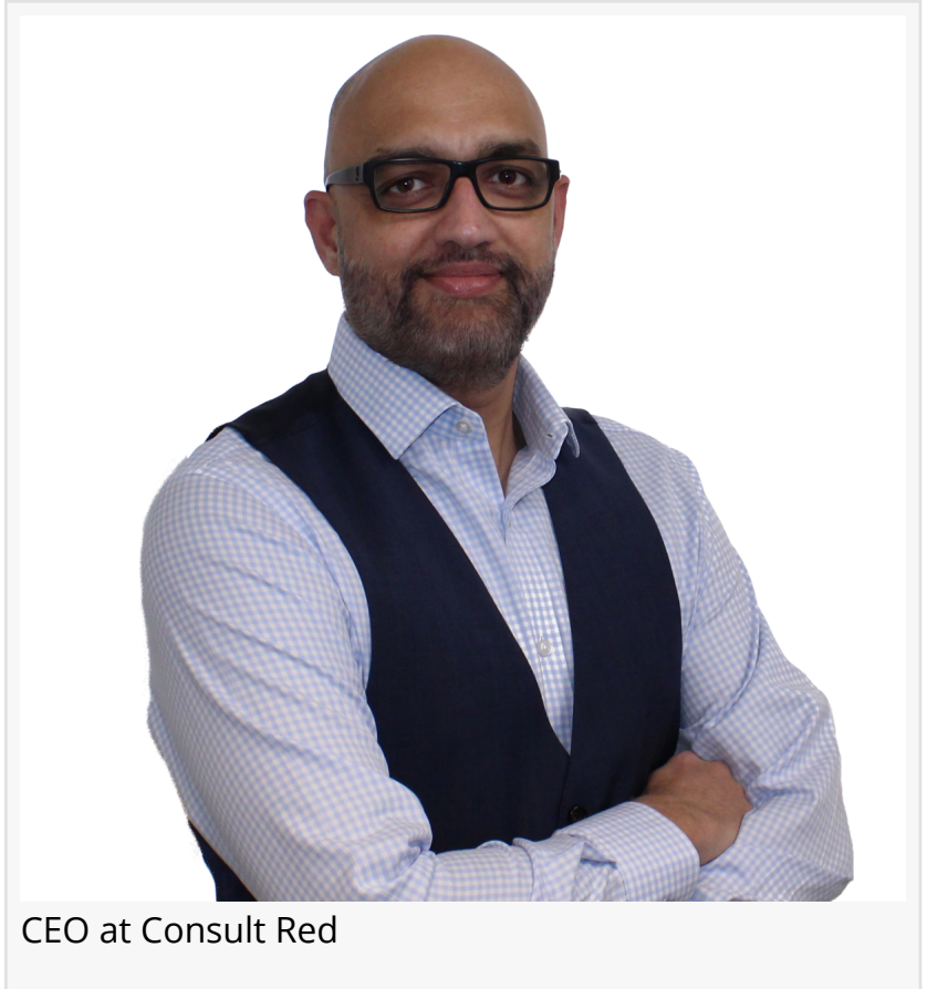
CEO at Consult Red

Since its inception in 2003, Consult Red has remained steadfast in its commitment to delivering trusted consultancy and high-quality engineering services, while embracing technological advancements and industry trends. Throughout the years, the company has built an enviable reputation for its dedication to excellence, customer satisfaction, and innovative solutions.