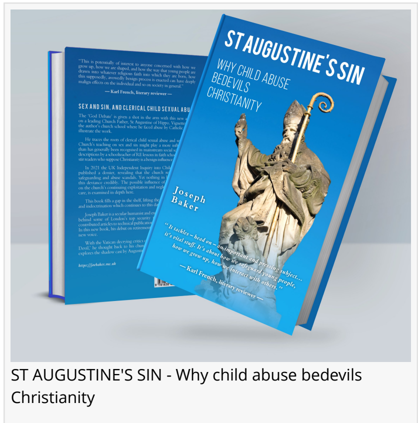
ST AUGUSTINE'S SIN - Why child abuse bedevils Christianity

An authority figure causing a child to feel guilt and shame is a documented method of child sexual grooming. Might this be an unwitting factor in cases of clerical child abuse?