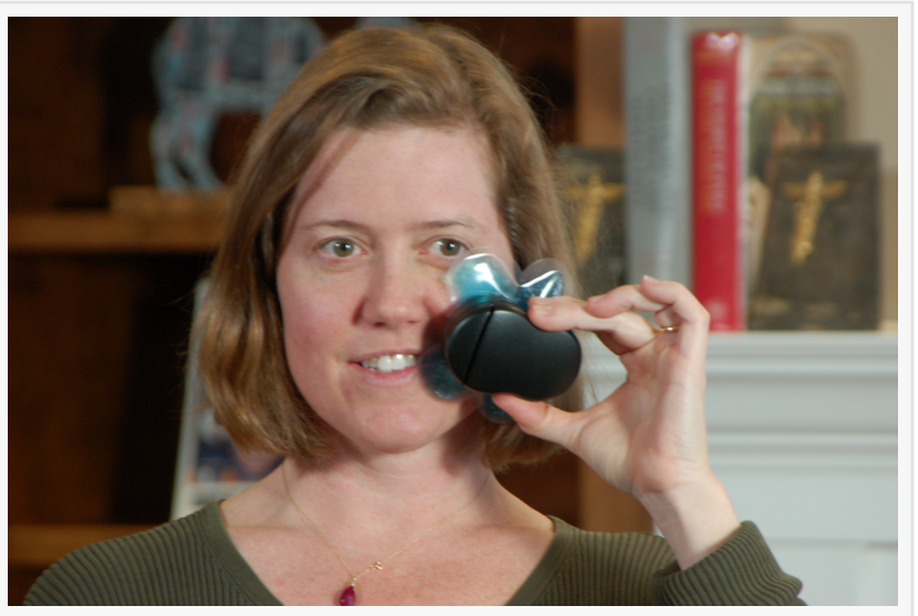
Buzzy self-applied to mandible for lower jaw injection pain relief

Buzzy's clearance holds immense potential to <u>improve oral healthcare</u> for millions worldwide. The unique combination of mechanical stimulation (M-Stim<sup>®</sup>) and ice provides relief during