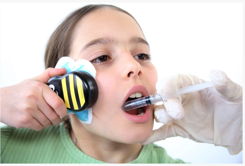
Buzzy self-applied by patient for injection pain releif