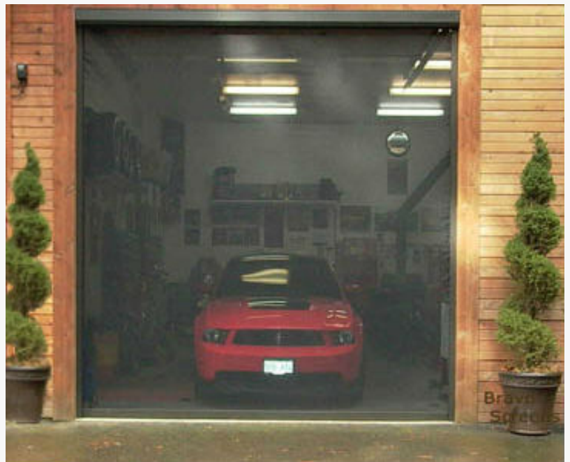
Motorized garage door screen

This press release can be viewed online at: https://www.einpresswire.com/article/645015424