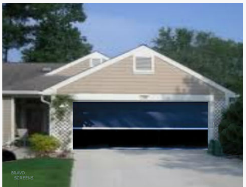
retractable screen garage door

Bravo screens allow evening breezes to cool while keeping unwanted pests out of your garage. The nearly invisible screens allow for excellent airflow. Bravo retractable screens are designed to retract completely, protecting them from tearing or damage. Bravo has redesigned all the double garage door models and provides a custom designed screen for oversized openings. Bravo retractable screens are renowned for its very large door sizes and openings, ensuring a seamless fit for all specific needs. Oversized screens have added strength for decks, pools, verandas, pergolas or any large area. As well, various mesh options will provide different levels of protection and privacy. A large retractable garage door screen adds years of enhanced outdoor living pleasure, offering convenience beyond standard garage door screens. One of the notable