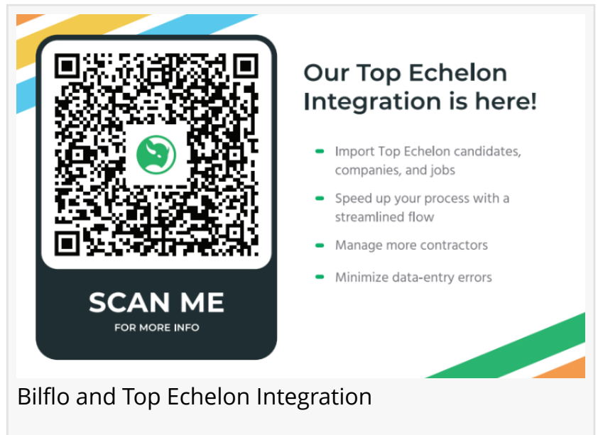
Bilflo and Top Echelon Integration

CHINO HILLS, CA, UNITED STATES, August 21, 2023 /EINPresswire.com/ -- Bilflo , a leading back office software solution designed to increase efficiency for staffing agencies and HR professionals, and Top Echelon Software , a leading provider of recruiting software solutions for small- and medium-sized businesses, are proud to announce their strategic partnership and innovative integration. The collaboration aims to improve contractor management, minimize data-entry errors, and expedite payroll processing for staffing agencies and HR professionals.