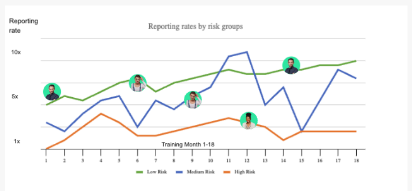
Figure 2 - Phishing Reporting by Risk Group