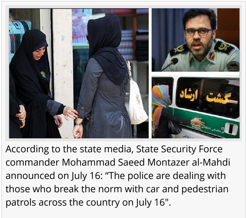
According to the state media, State Security Force commander Mohammad Saeed Montazer al-Mahdi announced on July 16: "The police are dealing with those who break the norm with car and pedestrian patrols across the country on July 16".

/EINPresswire.com/ -- The National Council of Resistance of Iran (NCRI) Foreign Affairs Committee in an article stated that According to the state media, State Security Force commander Mohammad Saeed Montazer al-Mahdi announced on July 16: "The police are dealing with those who break the norm with car and pedestrian patrols across the country on July 16."