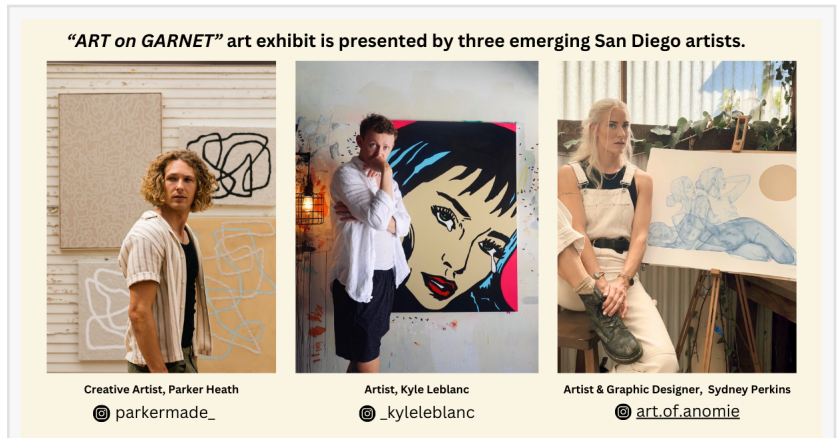
"ART on GARNET" art exhibit is presented by three emerging San Diego artists.