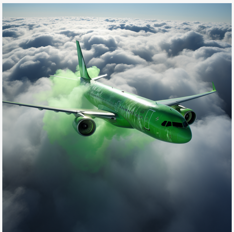
Hemp means we can fly green

Carbon credits, long recognised as a critical tool in offsetting carbon emissions, gain a new dimension through Tao Climate's visionary integration. By facilitating the purchase and utilisation of hemp carbon credits, airlines and individual passengers can now actively contribute to carbon neutrality and environmental restoration. This transformative model not only reduces carbon footprints but also fuels the growth of the global hemp industry, an untapped force in the fight against climate change. Hemp also shows great promise as a feedstock for Sustainable Aviation Fuel (SAF, see graphic), and as a lightweight construction material for aircraft.