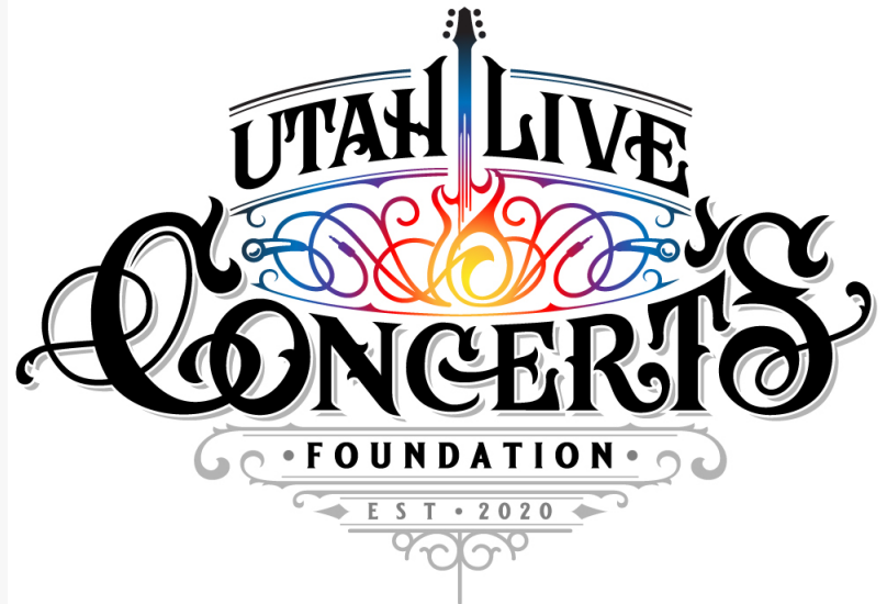
Utah Live Concerts Foundation (ULCF)

Registration for interested auto collectors is from 11:00 am – Noon August 19 with the display open to the Public from 12:00 Noon – 6:00pm.