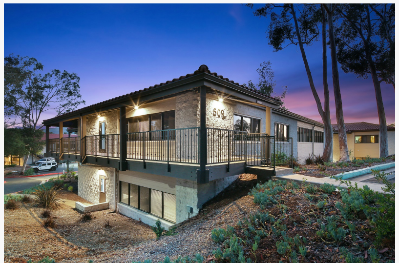
Exterior listing photo of Marin Corporate Center in Thousand Oaks, Calif.

THOUSAND OAKS, CALIFORNIA, U.S.A., July 20, 2023 /EINPresswire.com/ -- Peak Commercial ( peakcommercial.com ) a leading commercial real estate brokerage in Southern California, is excited to announce the immediate availability of spaces for lease at Marin Corporate Center . Located at 501 and 509 Marin Street in Thousand Oaks, California, this remarkable business center presents an enticing opportunity for entrepreneurs and business owners in search of office, coworking, medical spaces, and more.