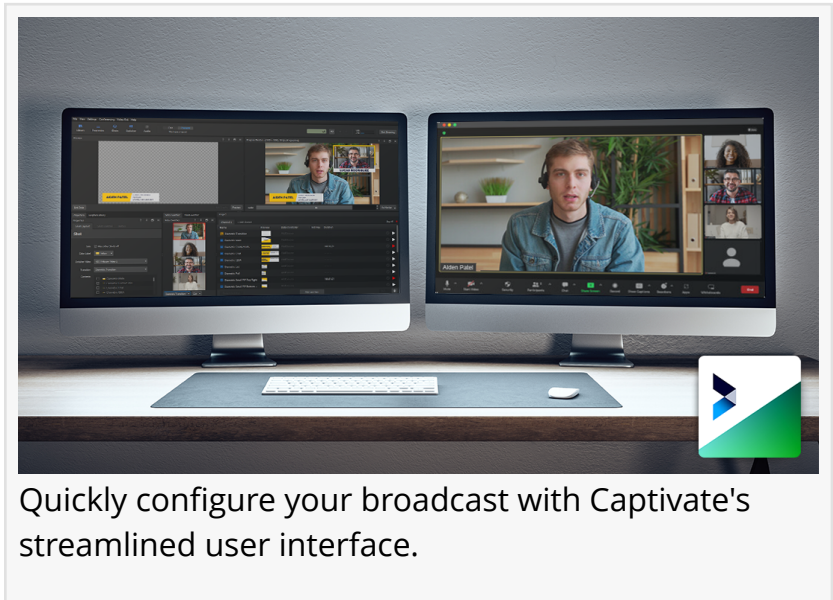
Quickly configure your broadcast with Captivate's streamlined user interface.

NewBlue Captivate propels the company's mission of enhancing video production with user-friendly, powerful graphics. By integrating vital video production components with advanced graphics, Captivate distills complex processes into streamlined workflows.