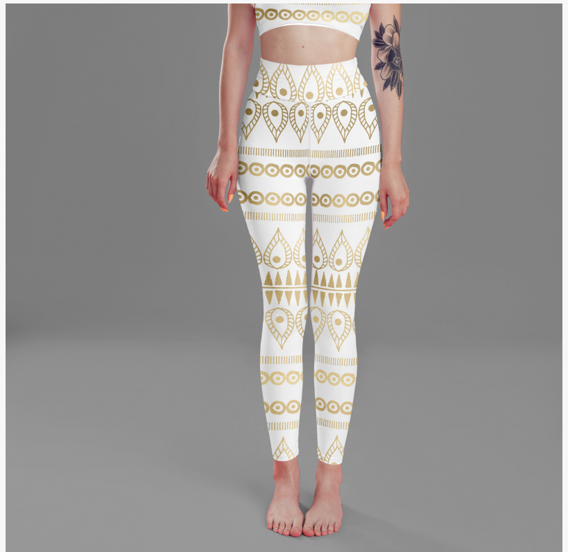
Bohemian Gold White High Waist Yoga Leggings to Wear at The Burning Man Festival from Happybeingwell.com