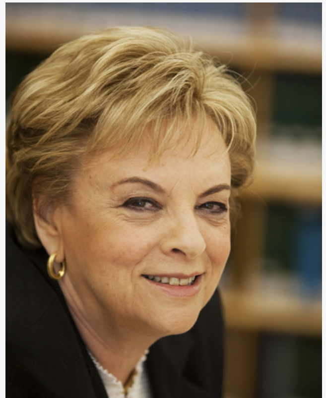
Dorit Beinish

The 'Distinguished Fellow' award, given by Oranim College, is awarded to extraordinary individuals who have made significant contributions to Israeli society. The award serves as a distinctive mark of the recipients' achievements and influence. By bestowing the award on Chief