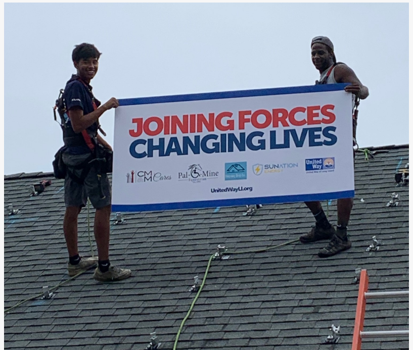
SUNation Energy solar installers are proud to be working on this donated solar panel system!