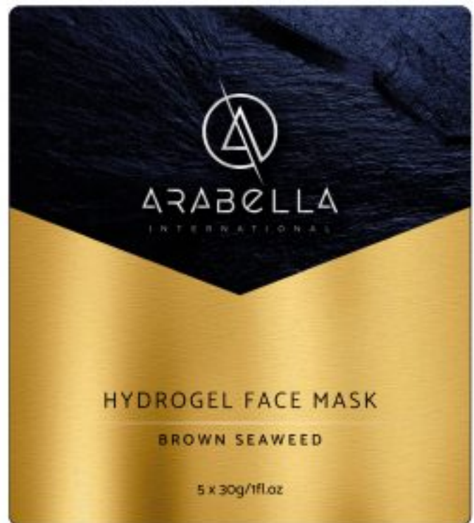
Brown Seaweed Hydrogel Face Mask