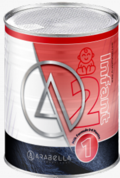
A2 Infant Milk Formula