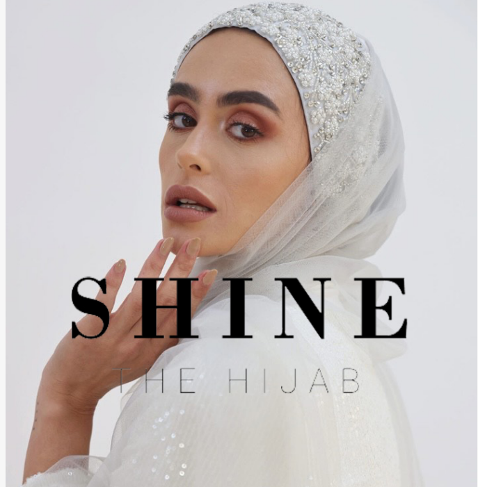
SHINE THE HIJAB Bridal and Occassions Collection