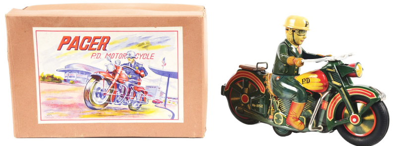
Alps (Japan) lithographed tin friction Pacer Police Motorcycle, 12¼in long, with original pictorial box. Near-mint condition including original driver's helmet. Estimate $1,500-$2,500