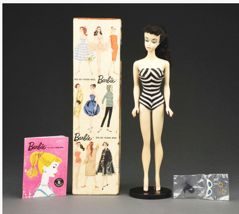
1959 first-issue brunette #1 Barbie Doll with box and original stand and complete set of accessories. Excellent condition. Estimate $6,000-$7,000