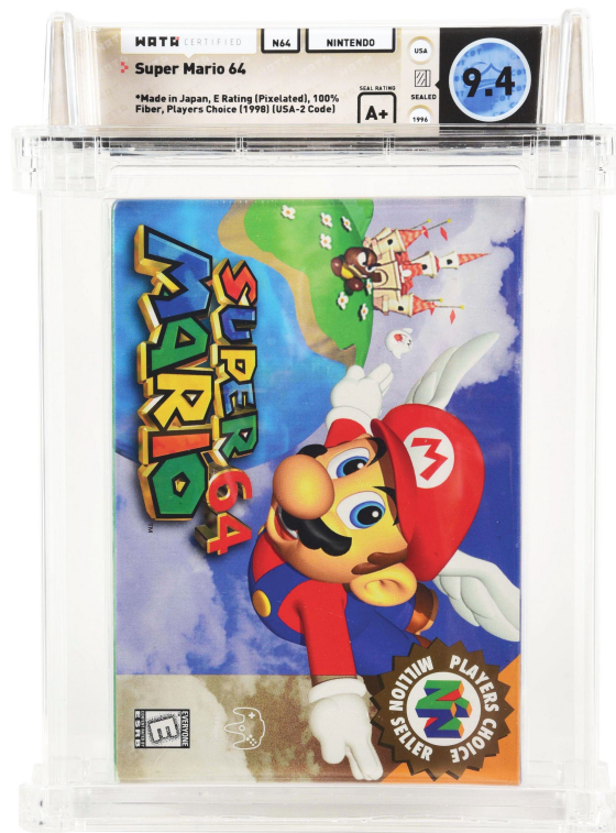
1966 Nintendo Super Mario 64, WATA-graded 9.4 A+ Sealed condition. A rare and extremely important title in extraordinary condition. Estimate $6,000-$9,000

Additionally, there are TV- and film-related wax boxes, including a 1975 Topps Planet of the Apes, 1978 Battlestar Galactica, and 1980 Topps Creature Feature. Each of the three boxes has been BBCE-graded, contains 36 packs and is estimated at $500-$1,000. A 1985 Topps Masters of the Universe 36-pack wax box carries a $750-$1,500 estimate.