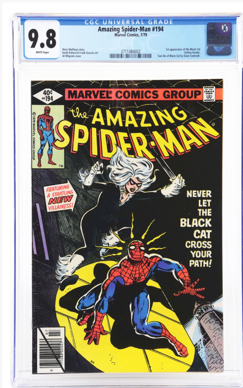
The Amazing Spider-Man #194, Marvel Comics (1979), CGC 9.8 Universal Grade. A beautiful example. Estimate $3,000-$6,000