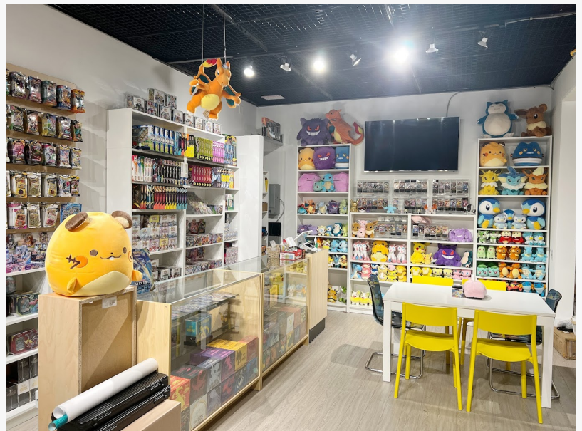
Photo of Banana Games