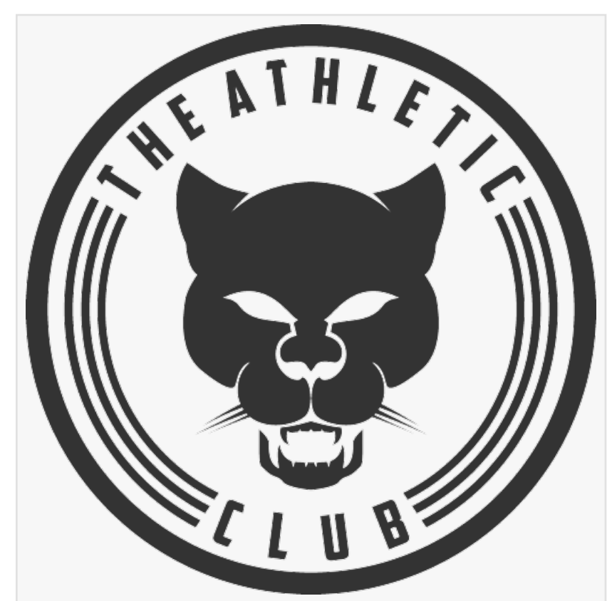
The Athletic Club Sports Facilities Logo

The Complex will benefit from a burgeoning youth sports tourism market, as well as a spike in adult recreational and competitive activities such as fitness challenges and pickleball. "The Colony has become a destination location for Texans as well as regional and national travelers, and once fully redeveloped, The Athletic Club will be yet another great reason to come to town," said Mayor Boyer.