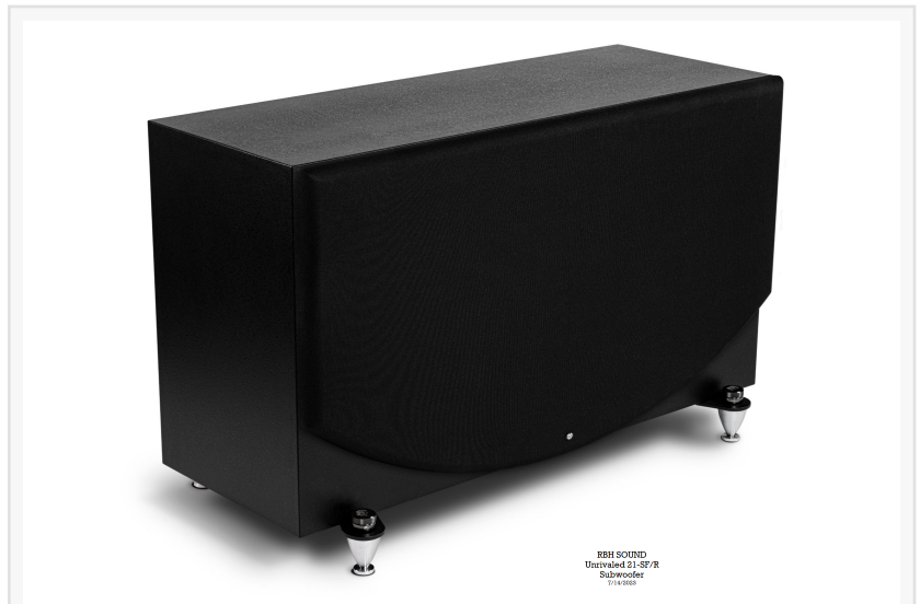
RBH Sound Unrivald 21-inch ultimate subwoofer system with grille

Kenny Muhlestein RBH Sound +1 801-543-2200 Kenny@rbhsound.com