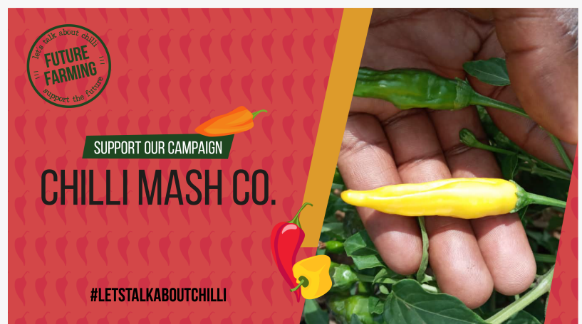
Chilli Mash Co. Crowdfunding Campaign Launch

As part of their crowdfunding campaign, The Chilli Mash Company has devised a range of