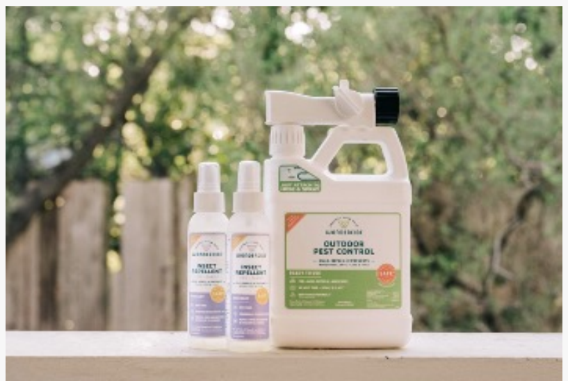
Say no to bites with Wondercide's Mosquito Control Kit

Even with all these ways of getting rid of mosquitoes, they can still be a nuisance. That's why Wondercide offers a plant-powered mosquito survival kit. First, spray the yard, patio, and garden with Outdoor Pest Control. The residue won't harm pollinators like bees or butterflies and there's