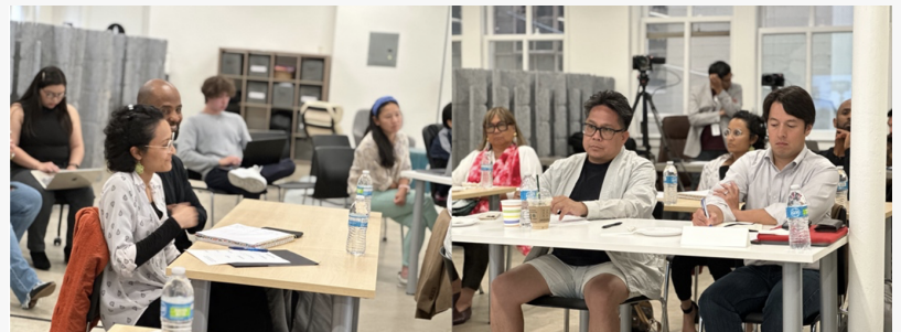
VCs, Impact Investors and individual investors attending the Demo Day