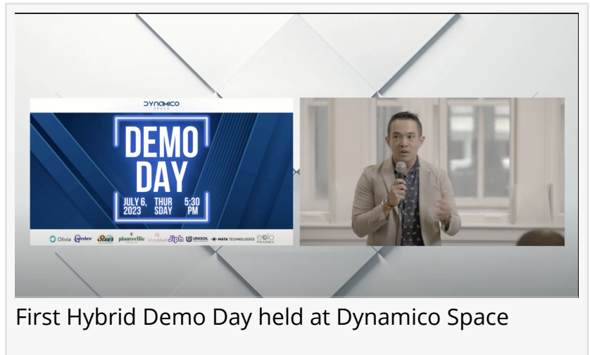
First Hybrid Demo Day held at Dynamico Space

/EINPresswire.com/ -- Dynamico Space conducted its first hybrid Demo Day event on 7 July 2023 with participation from seven Philippine and two Latin American (LATAM) startups. Demo Day is the third phase in a three-part series of Dynamico's Mentorship Program in which startups pitch to investors.