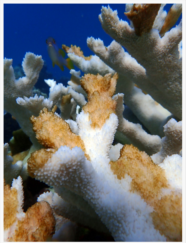
Close up of dead elkhorn coral at Sombrero Reef showing "tissue slough" - evidence that this coral has died as a result of the heat before it has had a chance to bleach

Coral Restoration Foundation<sup>™</sup> is calling on everyone to understand the gravity of the situation and lend their support. It is now vital that voters endorse policies and political candidates advocating for climate change solutions and environmentally sustainable practices.