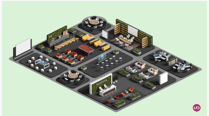
RewireHub Client Zone