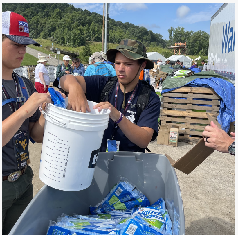
Scouting's large-scale "Flood Bucket" service project at its National Jamboree in West Virginia assembled 5,000 buckets containing essential items needed by flood victims to help restore their homes and lives. Each bucket also contains a personal note

Scouts participating in the project are excited for the opportunity to serve victims across the