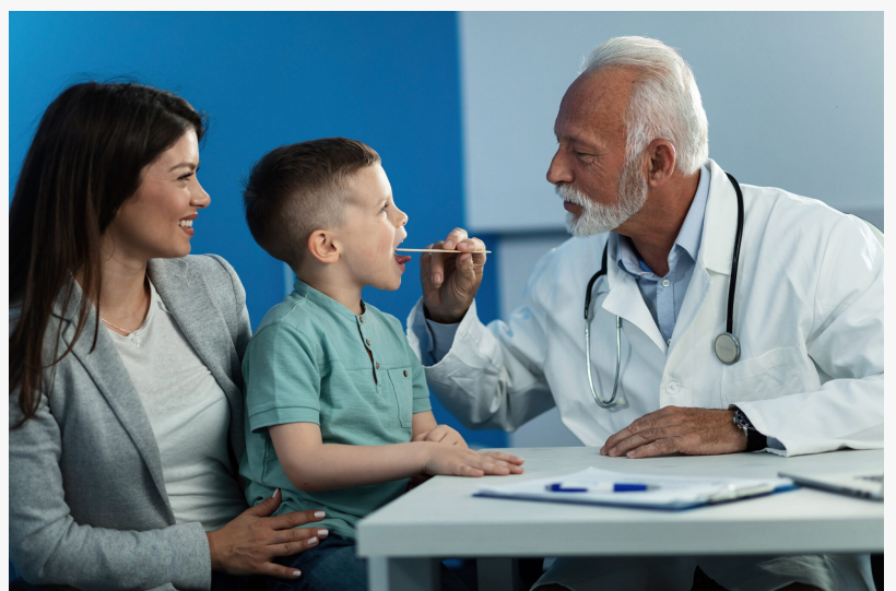
best Children ENT Specialist

With their skills and knowledge, ENT doctors offer the required medical care to individuals of all ages, helping them regain Ear, Nose and Throat health and well-being.