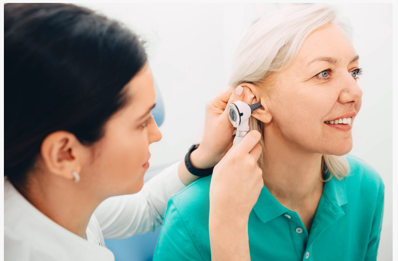
ENT Specialist Northamptonshire