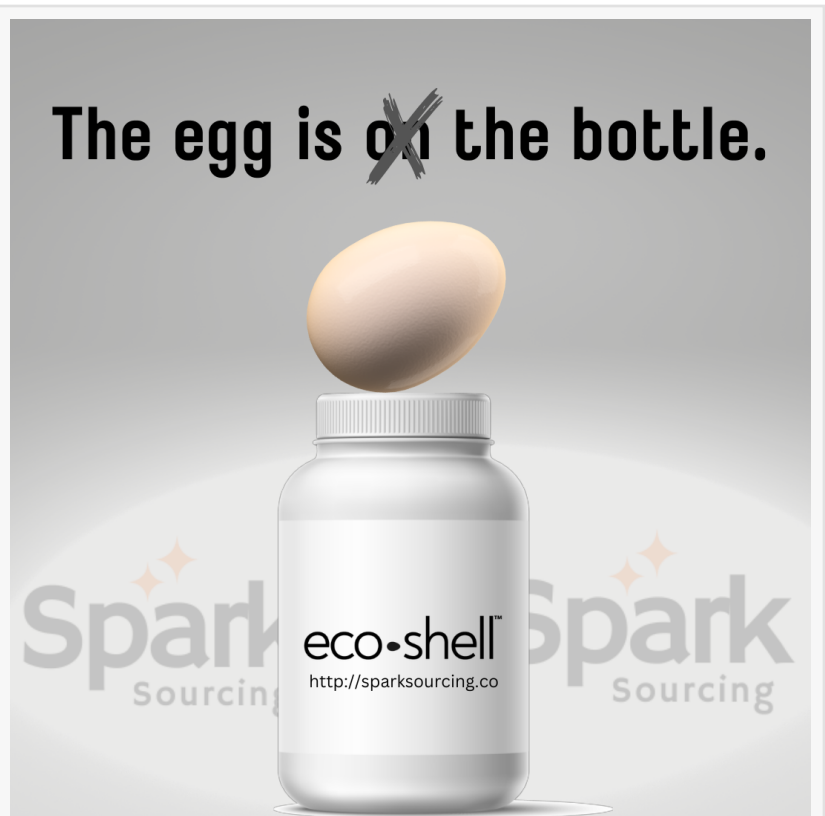
eco-shell is the bottle

For the above and all other industries, whether it be bottles for body wash or protein powder, eco-shell™ is an affordable and quick way for companies to meet upcoming plastic reduction mandates, and an impactful way for brands to reach their sustainability goals. eco-shell™ can be incorporated seamlessly into current manufacturing, so companies do not need to change the shape, size, material, or design of their current product or packaging, or the subsequent shipping dimensions. If preferred, Spark Sourcing can also handle all manufacturing for brands through its network of partner factories across Taiwan that are experienced with using eco-shell™. Andrew Bliss, founder of Spark Sourcing, expands: