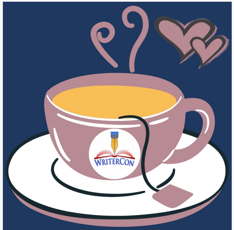
Literary Tea at WriterCon

The Books That Make You ReaderCon Literary Tea promises a fun, fanciful event that would make the Mad Hatter envious. The tea features author readings, discussing their books, reading book excerpts, and doing an array of bookish presentations.