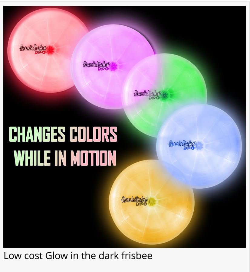
Low cost Glow in the dark frisbee

By leveraging Buybackstore's end-to-end 3PL solution, businesses(ACP) can focus on their core competencies while entrusting the logistics function to them. It can lead to cost savings, improved operational efficiency, faster order fulfilment, scalability, and enhanced customer