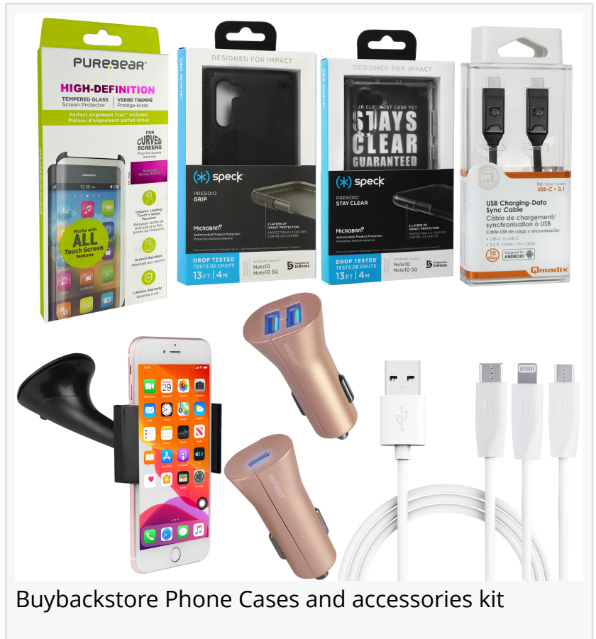
Buybackstore Phone Cases and accessories kit

/EINPresswire.com/ -- In today's fast-paced digital world, smartphones have become an indispensable part of our lives. However, keeping up with the latest models can be expensive and environmentally damaging. Fortunately, Buybackstore LLC Refurbished phones offer a sustainable and cost-effective alternative that benefits both the economy and individual consumers. We will explore how refurbished phones contribute to economic growth, foster personal savings, and provide excellent quality to users.