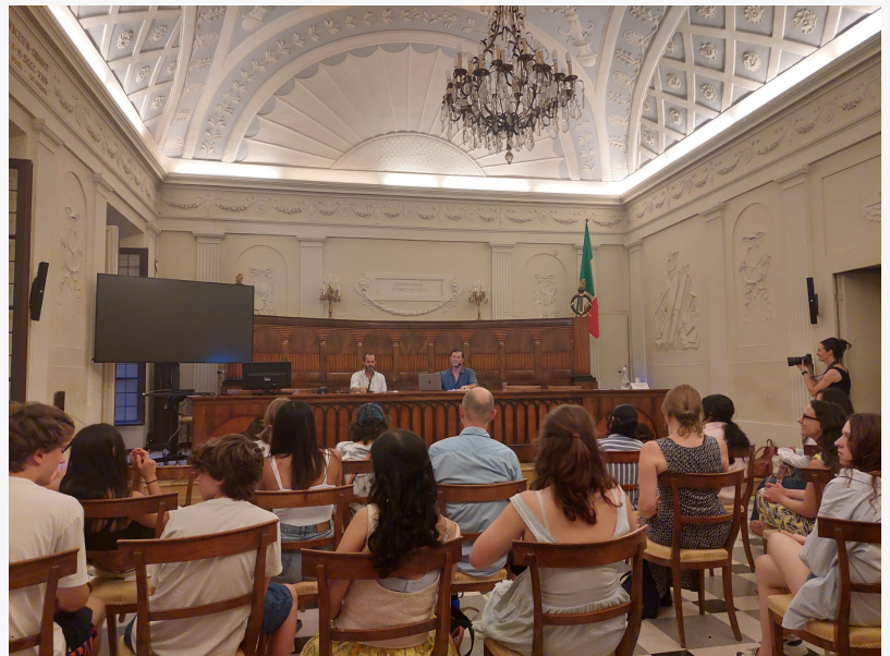
Author Reading in Siena, Italy