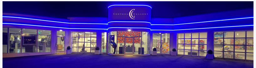
Contessa Gallery, One Pond Lane, Southampton, NY

The event programming will kick off with a special meet and greet featuring the world-renowned artist eL Seed. An exceptional contemporary artist, eL Seed's creative expertise spans the