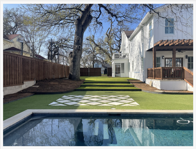
Residential turf installation by Southern Turf Co.

Artificial turf installations by Southern Turf Co. offer numerous advantages, including water conservation, reduced maintenance costs, and a year-round green appearance that can withstand