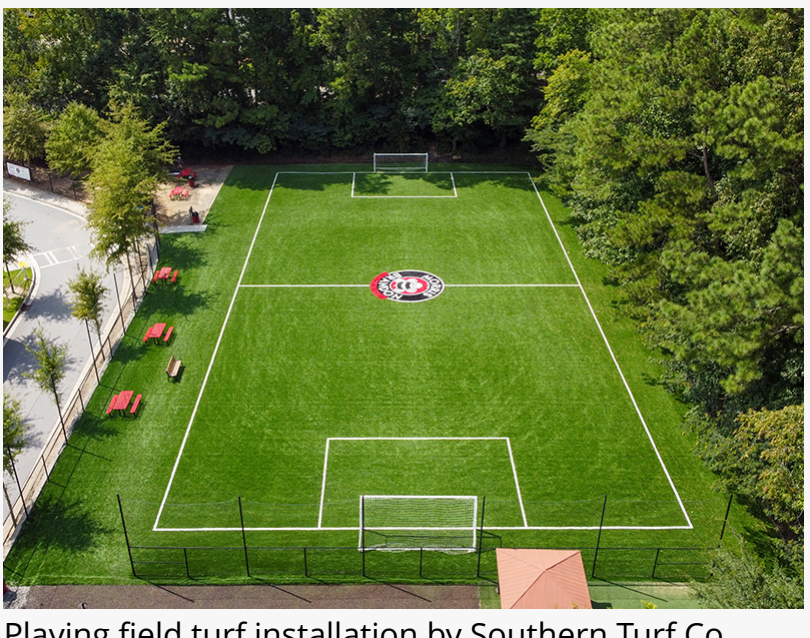
Playing field turf installation by Southern Turf Co.

This press release can be viewed online at: https://www.einpresswire.com/article/646156852