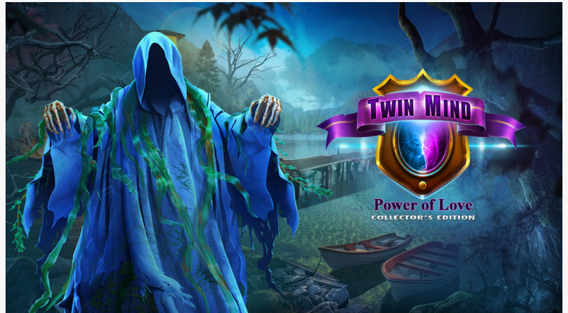
Title image for Twin Mind: Power of Love

In the world of Twin Mind: Power of Love, players will become Randall and Eleanor, the twin detectives who each bring a unique approach to every case. Randall is a forensics expert who uses science and logic, while Eleanor uses intuition and arcane mysticism to find the clues.