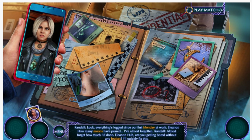
Real game-play image from Twin Mind: Power of Love