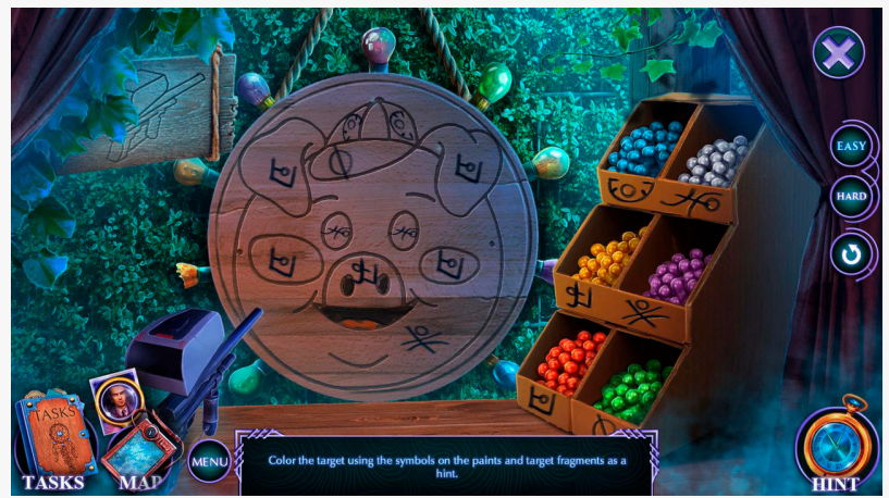
Real game-play image from Twin Mind: Power of Love