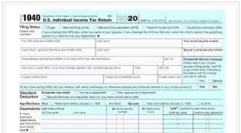
Printable IRS 1040 Tax Forms

Comprehensive Selection: The IRS provides a wide range of printable tax forms to accommodate various tax situations, including Form 1040 for individual income tax returns , Form 1099 for reporting certain types of income, and Form 4868 for requesting an extension to file.