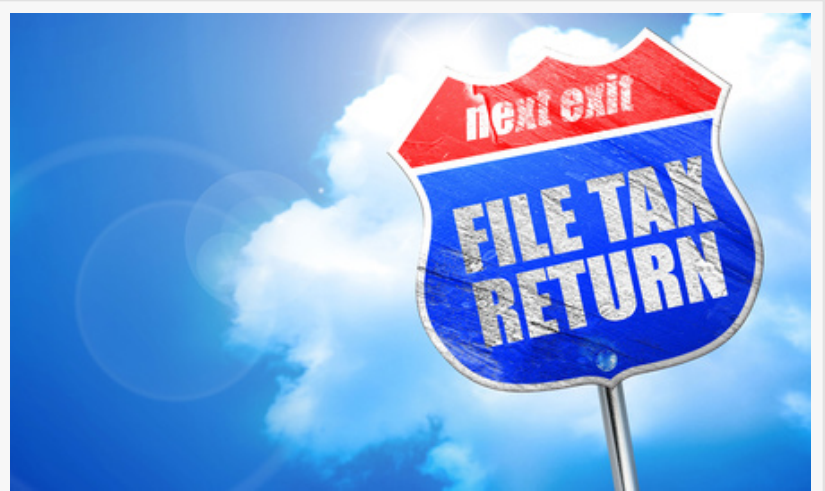
Tax Filing Start Date

Save Time and Money: By opting for printable tax forms, taxpayers can avoid the hassle of visiting local IRS offices or waiting for forms to arrive by mail. Additionally, printing forms at home or at a local library saves on printing and postage costs.