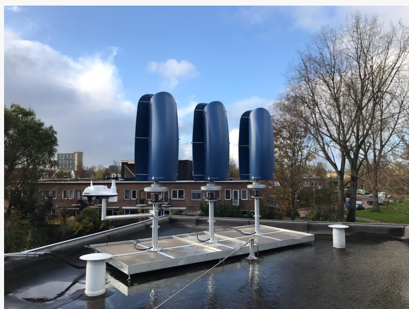
Flower Turbines Small Size Wind Tulip Installation