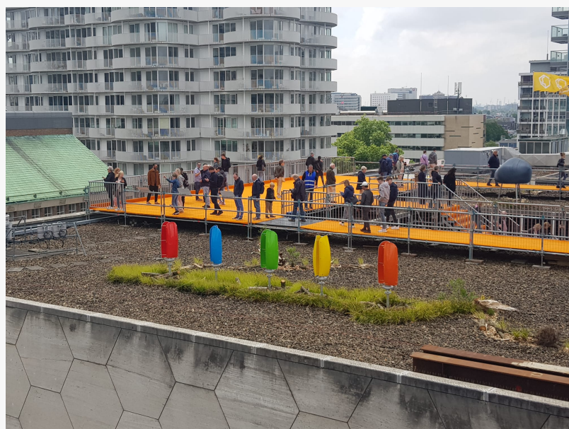
Flower Turbines at Rotterdam Roof Days