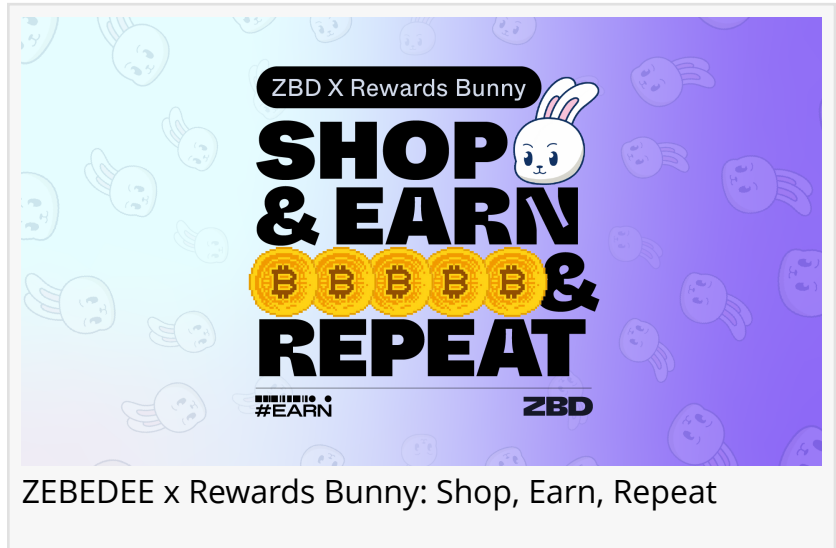
ZEBEDEE x Rewards Bunny: Shop, Earn, Repeat

HOBOKEN, NJ, US, July 26, 2023 /EINPresswire.com/ -- ZEBEDEE , the next-generation FinTech powering rewarded games and apps, today announced they've partnered with Rewards Bunny to give shoppers Bitcoin rewards with every purchase, bringing shopping into the quickly growing ZBD ecosystem of games, apps and communities.