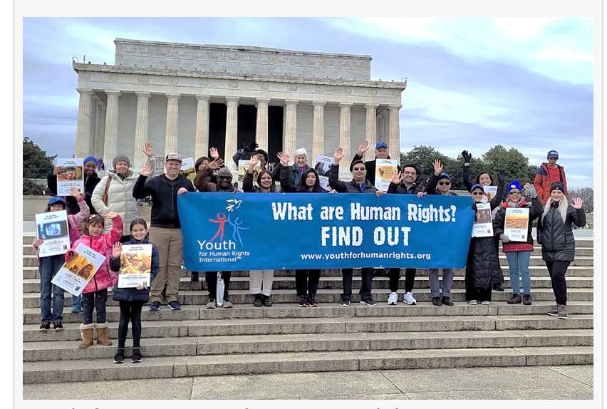
Youth for Human Rights group celebrating Human Rights Day on Dec. 10th at the Lincoln Memorial to raise awareness of the 30 human rights

and inspire them to become valuable advocates for tolerance and peace. Children are the future. They need to know their human rights and know that they must take responsibility to protect themselves and their peers.