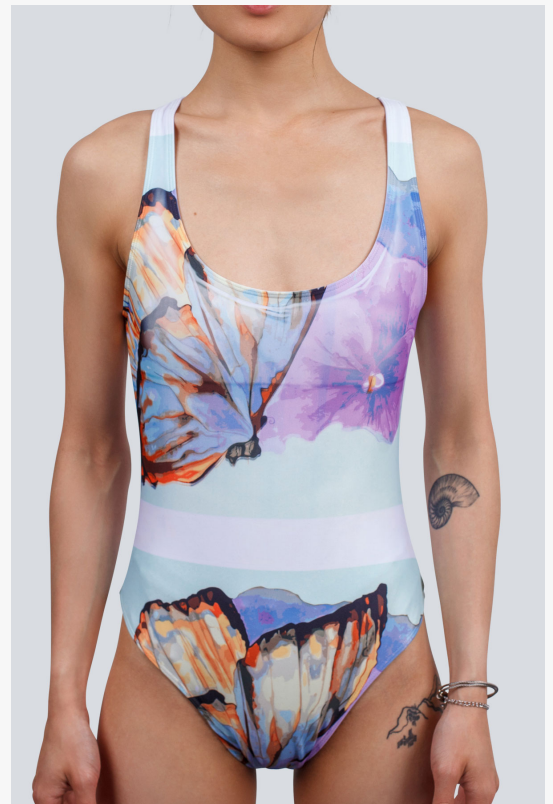
The Butterfly One Piece Swimsuit