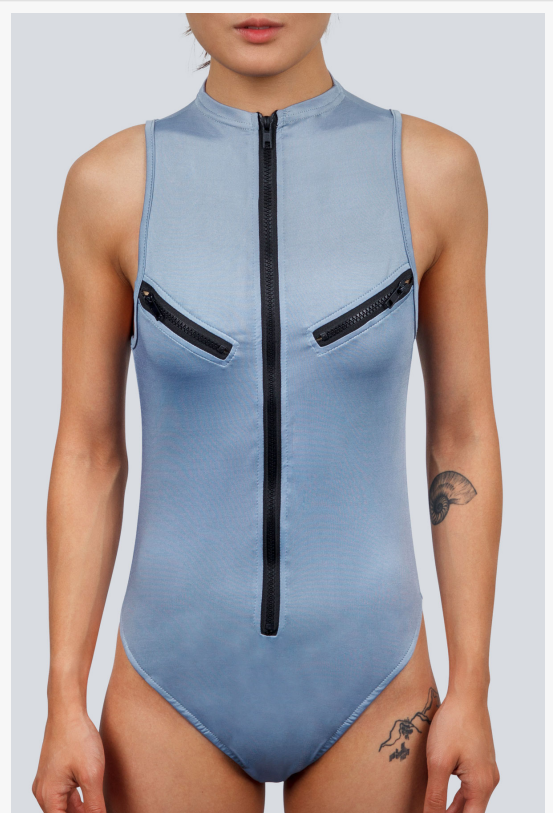
Zippered One Piece Swimsuit