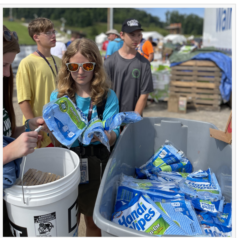
Scouting's Flood Bucket service project at the National Jamboree prepared more than 5,000 buckets, the largest number ever assembled in a single effort, according to the program's organizers.

In response to this expanding natural disaster, and consistent with its service orientation, the Boy Scouts of America has engaged many of the 15,000 Scouts and Scouters currently attending its National Jamboree in the "Flood Bucket" project, to assemble at least 5,000 cleaning kits – consisting of 15 essential supplies – that will help flood victims to reconstruct their lives.